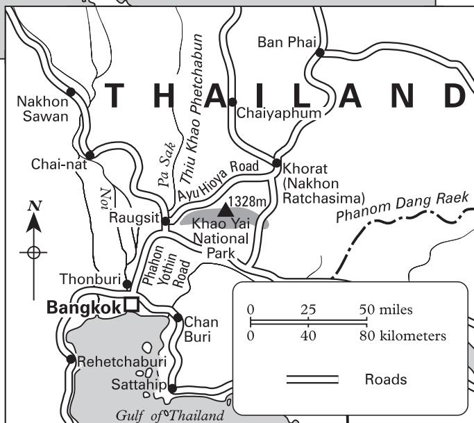
Thailand and the Khao Yai National Park