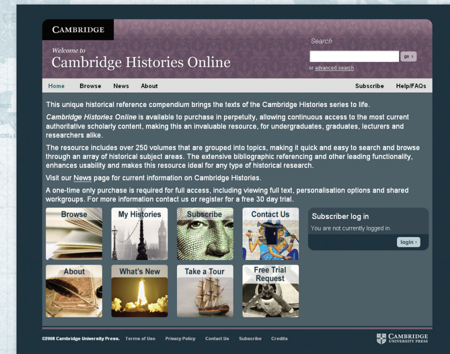
Cambridge Histories Online Homepage

New Cambridge Histories titles will be added to the collection on publication.